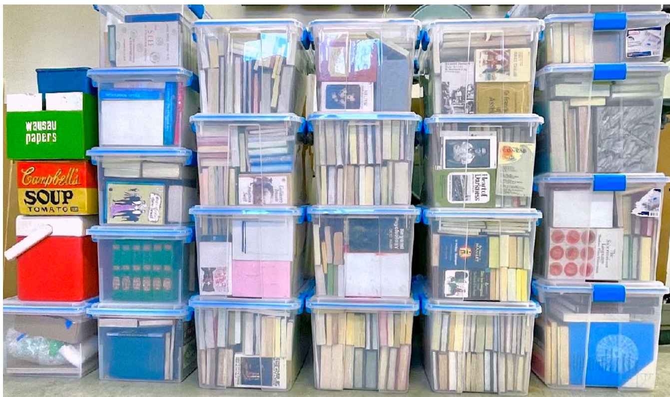
studio image of Untitled Project: Robert Smithson Library & Book Club in storage bins, 2021