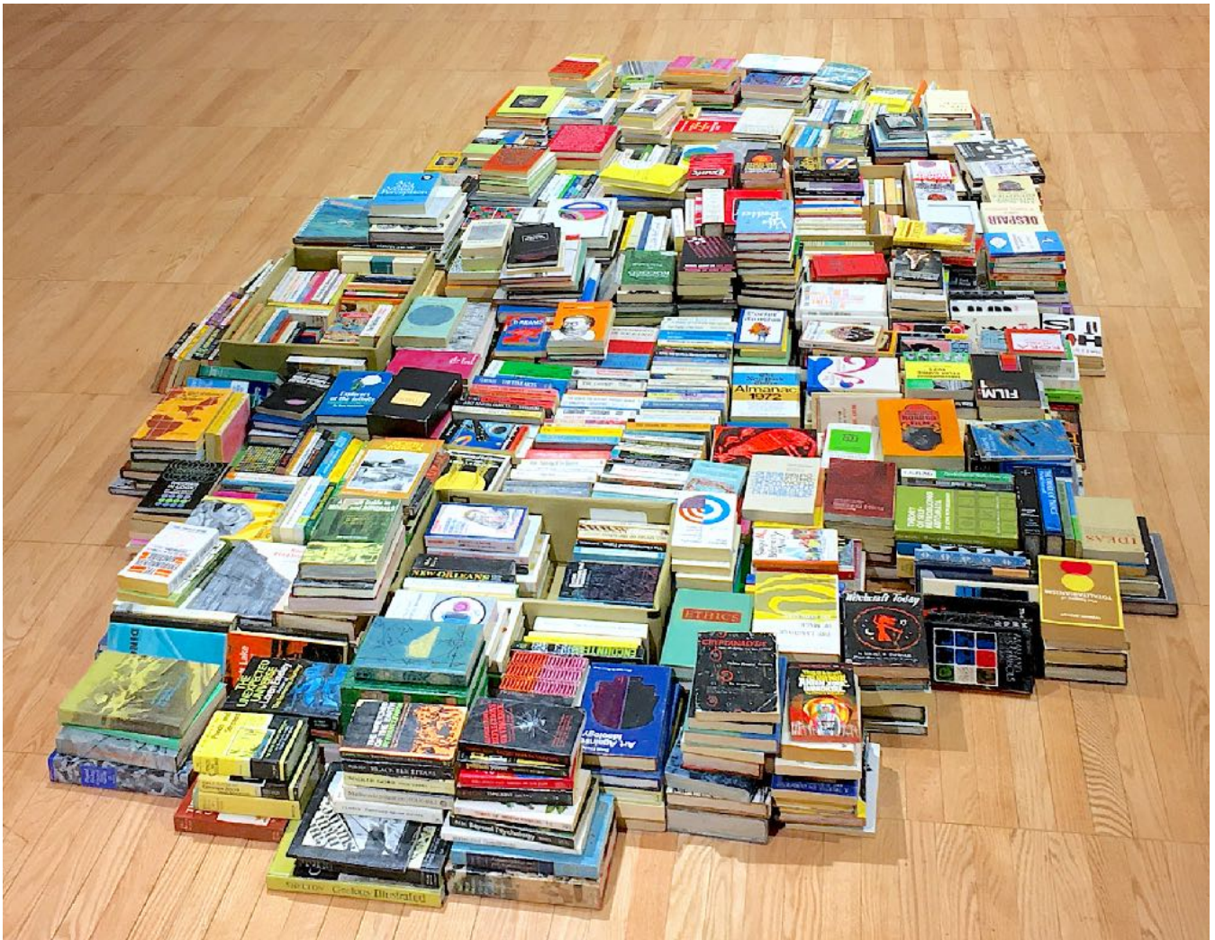
image of Untitled Project: Robert Smithson Library & Book Club installation in pile formation at the Krannert Art Museum, 2019