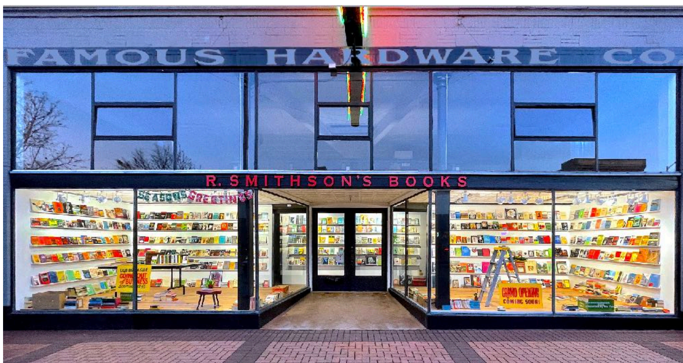
image of Untitled Project: Smithson's Books installed in the storefront windows of the Famous Hardware building in Springdale, Arkansas, 2021