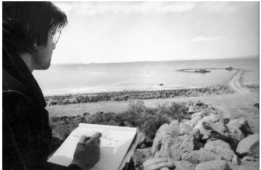
image of Robert Smithson posing with rocks on a station wagon and sketching during the construction of Spiral Jetty.