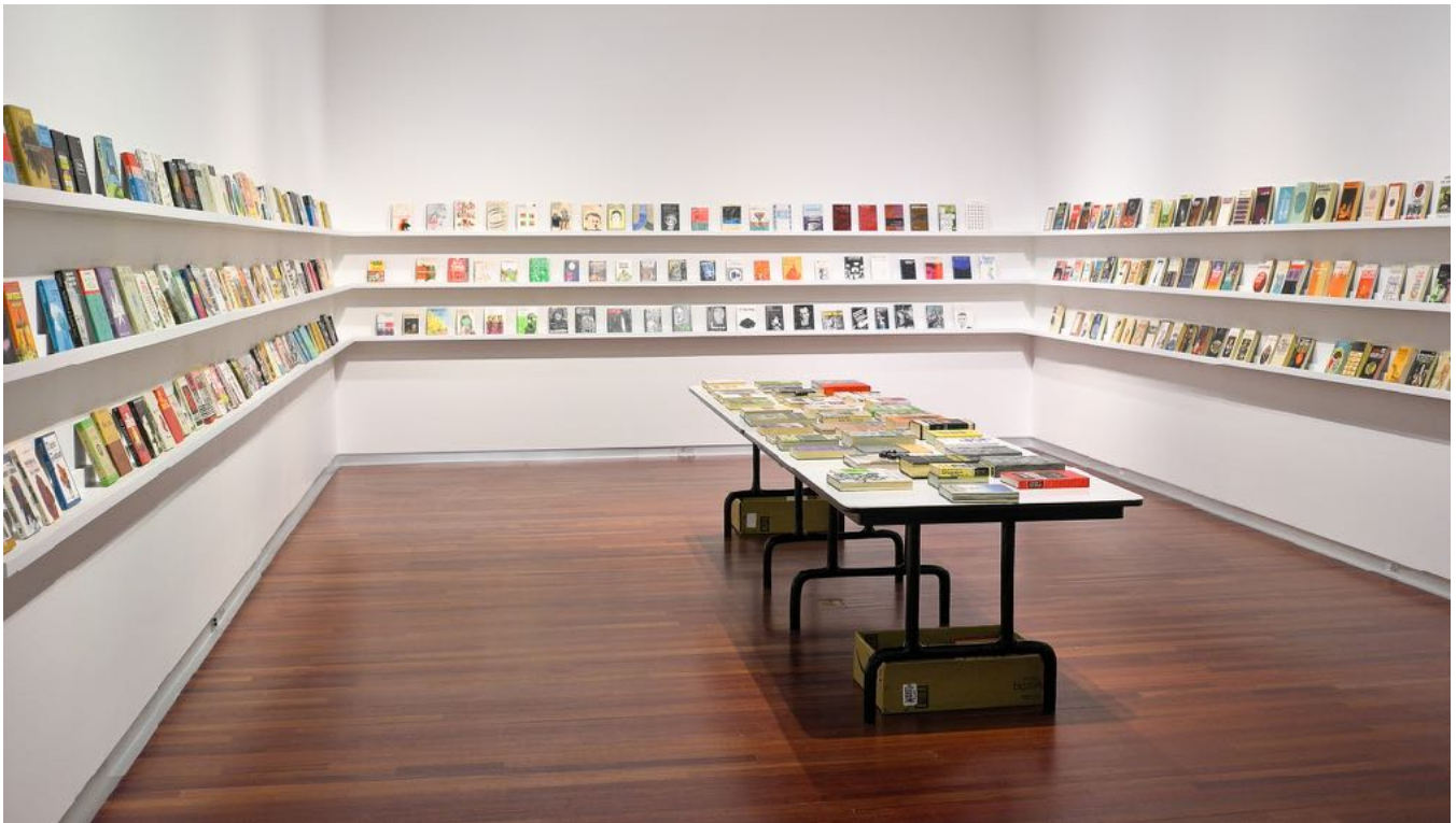
detail of Untitled Project: Robert Smithson Library & Book Club installation at the Utah Museum of Fine Arts, 2014

Untitled Project: Robert Smithson Library & Book Club took five years to complete, starting in 2014 as part of a solo exhibition at the Utah Museum of Fine Art at the University of Utah, with only half of the books/sculptures completed. Additional books/sculptures were added to subsequent exhibitions, in 2015 at the Wright Museum at Beloit College and in 2017 at the Cress Gallery (now known as the Institute of Contemporary Art ) at the University of Tennessee at Chattanooga. The primary archive was finally completed in 2019 when all the books/sculptures were exhibited in the form of a large pile in the Krannert Art Museum at the University of Illinois. The most recent iteration of this project occurred in 2021, as Untitled Project: Smithson's Books , an installation of the completed primary archive in the format of a used book store in the storefront display windows of the Famous Hardware building in downtown Springdale, Arkansas.