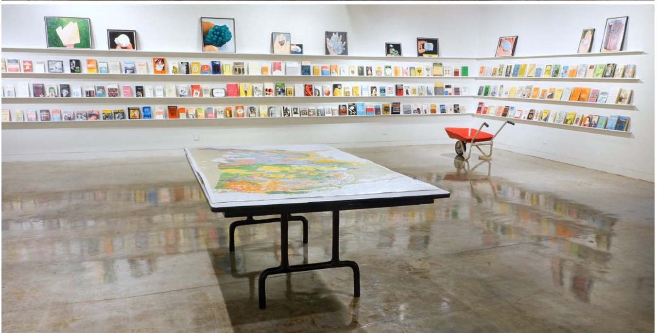
detail(s) of Untitled Project: Robert Smithson Library & Book Club + Untitled Project: The Crystal Land installation at the Cress Gallery (now known as the Institute of Contemporary Art) at the University of Tennessee at Chattanooga, 2017