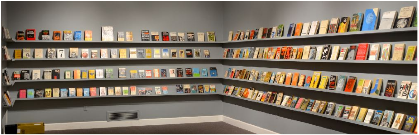
detail of Untitled Project: Robert Smithson Library & Book Club installation at the Wright Museum at Beloit College, 2015