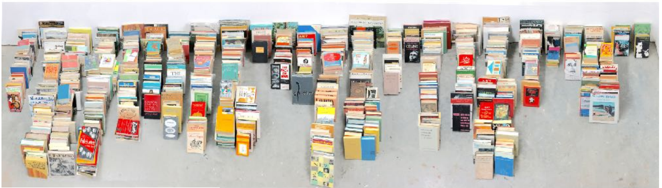
studio image of Untitled Project: Robert Smithson Library & Book Club arranged by author's last name. 2019