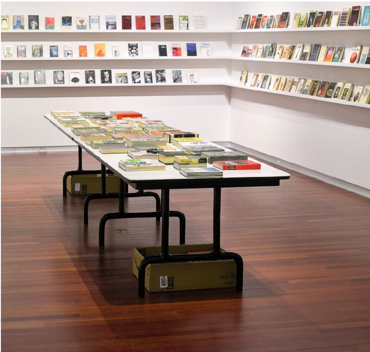
detail of Untitled Project: Robert Smithson Library & Book Club installed at the Utah Museum of Fine Arts in 2014

The Library is the primary archive, a literal recreation of every book/title in Robert Smithson's personal library. Each book is a sculpture that has been carved out of wood at 1:1 scale and painted on the front and sides to look like the original title/edition using reference images from online booksellers from Amazon to eBay. This strategy involves an earnest attempt at verisimilitude in spite of the limitations of painterly representation and the inevitability of errors generated from the online research, but all of this is a deliberate strategy to activate the dialectical shift between the carved and painted book/sculpture and the real, similar to Smithson's own terms of site and non-site ).